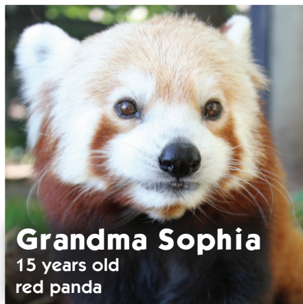
Grandma Sophia 15 years old red panda