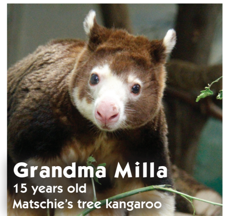
Grandma Milla 15 years old Matschie's tree kangaroo