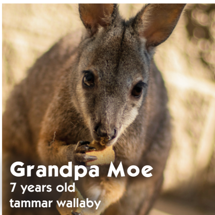
Grandpa Moe 7 years old tammar wallaby

This year when celebrating Grandparents Day on September 10, remember the animal grandmas and grandpas at the Zoo as well.