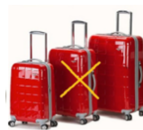
HARD SIDED BAGS