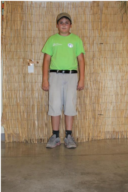
Great Job! Shorts at or past fingertips, shirt tucked in, nametag present and on left side, Zoo Crew hat, and close toed shoes