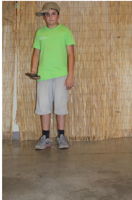
Needs Work! Forgot nametag, shoes untied, shirt un tucked, using cell phone during a Zoo Crew shift, and hat not worn properly.