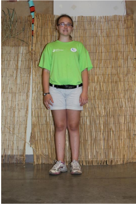
Great Job! Shorts at or past fingertips, shirt tucked in, nametag present and on left side, close toed shoes, hair pulled back out of face

Neck: Any necklaces worn must be kept under the shirt at all times. This for your safety and the safety of the animals.