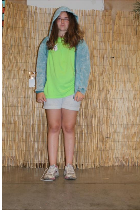
Needs work! Nametag on the wrong side, shoes untied, shirt un tucked, wearing a sweatshirt that is not part of the Zoo Crew uniform, hair down and in face

Chest: A Zoo Crew uniform shirt needs to be worn at every shift. Zoo Crew sweatshirts, hoodies or solid black sweatshirts may be worn. No logos are permitted. Coats and raingear of any type may be worn in the event of inclement weather.